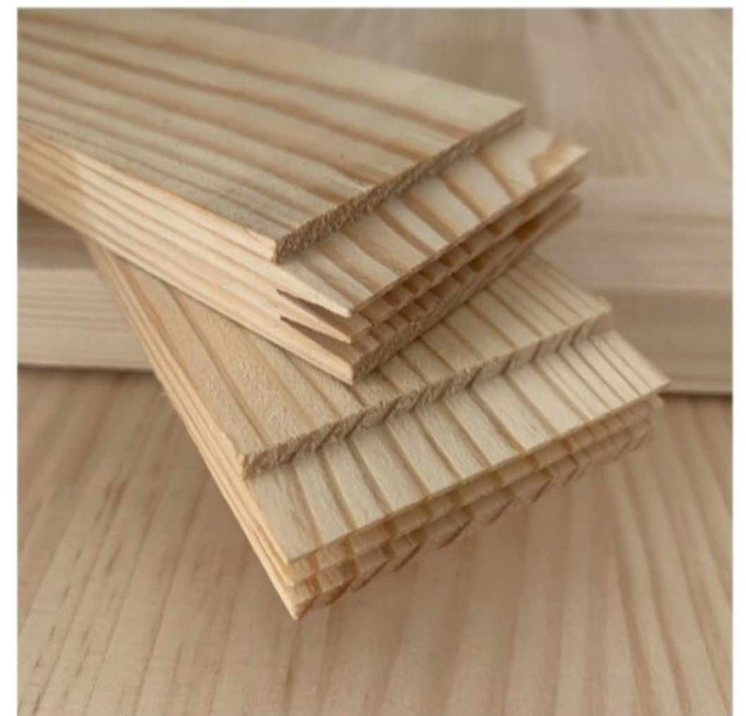
Pine Wood FJL Boards