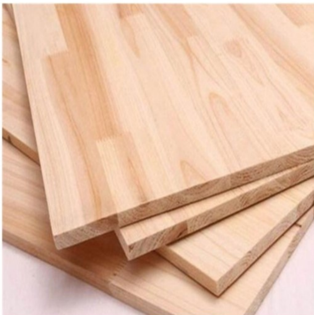
Rubber Wood FJL Boards